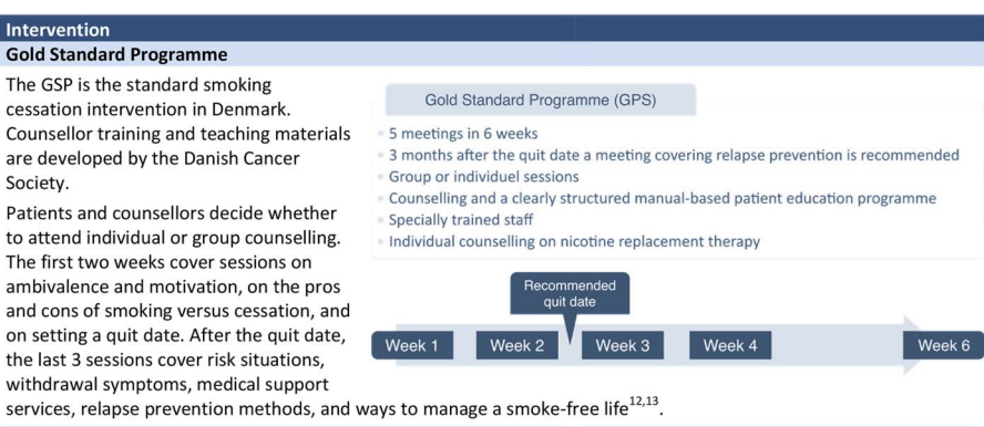
Figure 1 Descriptions of smoking cessation interventions examined in this study. GSP, Gold Standard Programme; SCDB, Smoking Cessation Database.